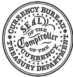
Acting Comptroller of the Currency